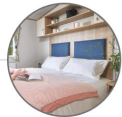
Fabric headboards in all bedrooms