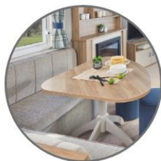
Fixed dinette seating